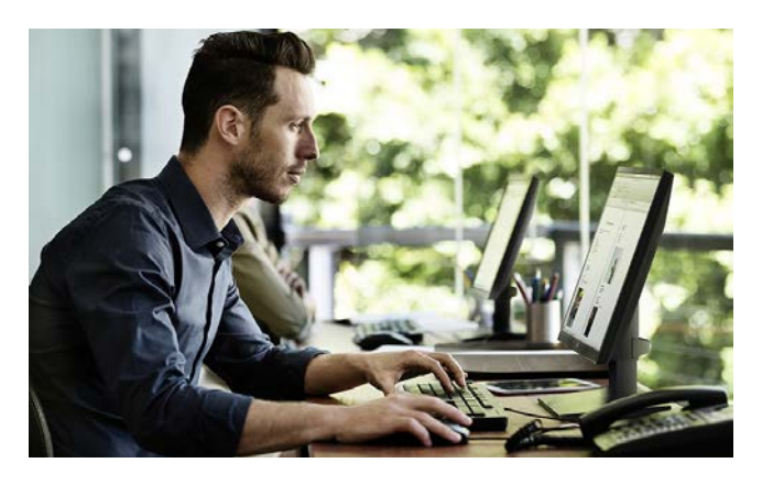
IMPROVED OPERATIONAL EFFICIENCIES. The ultra-simple user interface single endpoint solution makes network management a breeze. LG Cloud Solution devices are intuitive and easy to operate, in fact, a single administrator can manage thousands of endpoints remotely.

ELEVATE THE USER EXPERIENCE. LG Cloud devices work within a Virtual Desktop Infrastructure (VDI). that optimizes unified communication solutions to allow employees to collaborate and move more freely within your workplace or any outside location. Onboard collaboration tools further streamline this process. This seamless, intuitive digital environment can enhance productivity across the entire enterprise.